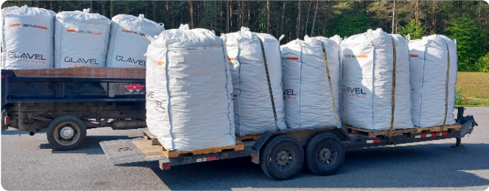
Facility pickup, CY varies based on hauling equipment