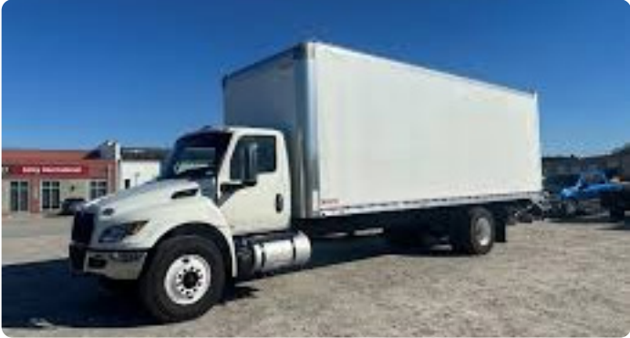
Box truck delivery, 33CY per truck

Customer pickup can also be arranged from the manufacturing plant in Essex, Vermont. Scheduling in advance and a vehicle rated for the load's weight and volume are required. The Glavel team will assist with loading.