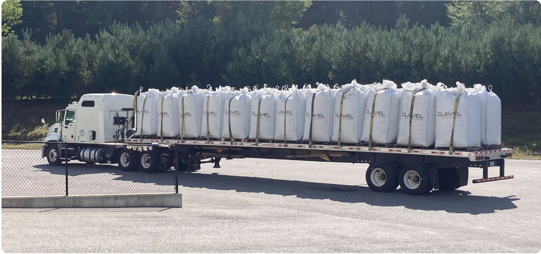
Flatbed delivery, 72CY per truck